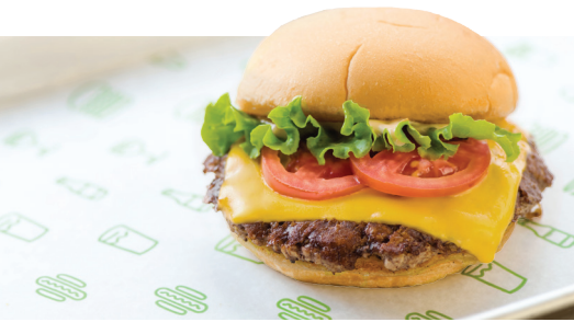
↑ Shake Shack

With over a hundred restaurants and eateries, the new Jewel Changi Airport is a veritable foodie hotspot. Here's what to try