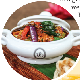
↑ Violet Oon Singapore

As its name suggests, O'TAH takes the humble otah (grilled fish cake) and elevates it in dishes such as the Reuben Roll, where otah chunks, prawns and coleslaw are sandwiched in a grilled brioche; as well as the Ben's Burger, where a breaded otah patty is the star of the show.