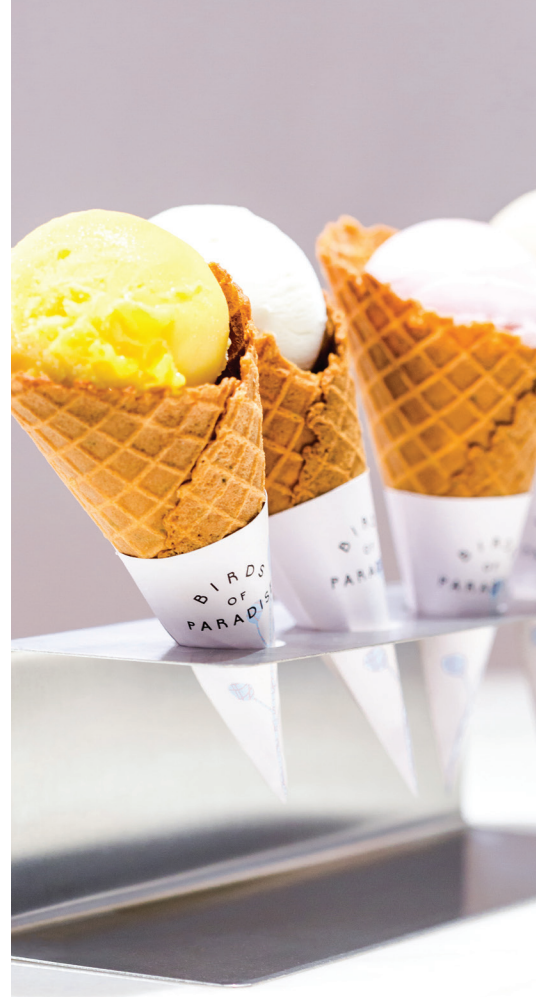
↑ Birds of Paradise